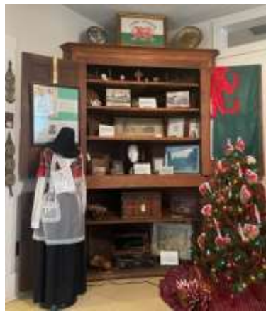
At left, the Gomer Welsh Community Museum, and the Welsh Christmas display at the museum.