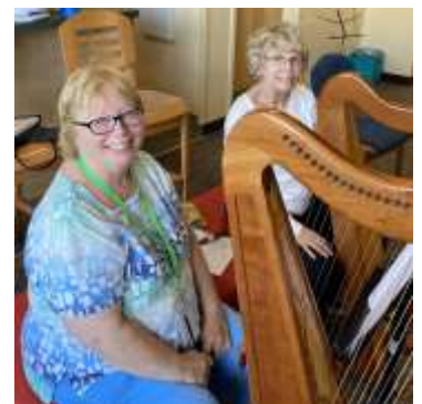
Left: Charing of the Bard ceremony at the 2022 Welsh Heritage Week Right: Learn to play the harp!

It's not too late to sign up! If you have any questions, you contact Beth Landmesser, 570-815-7689 or hwyl@ptd.net . You can also follow Welsh Heritage Week on Facebook.