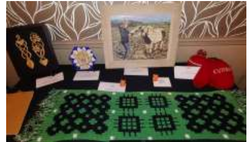
2022 NAFOW Visual Arts Entries

Visual Arts - Your anonymous entry is displayed at NAFOW and adjudicated by a secret ballot public vote (one vote per person). Entries might include fabric art, painting, sculpture, collage and so forth. This year's theme is "Roots/Gwreiddiau." Entry deadline is August 21, 2023. Sponsored by the Welsh Gymanfa Ganu Association of Wisconsin