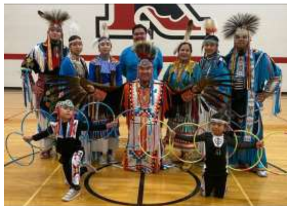
Many Moccasins is one of the featured local groups.

Check the website later in the year as plans unfold.