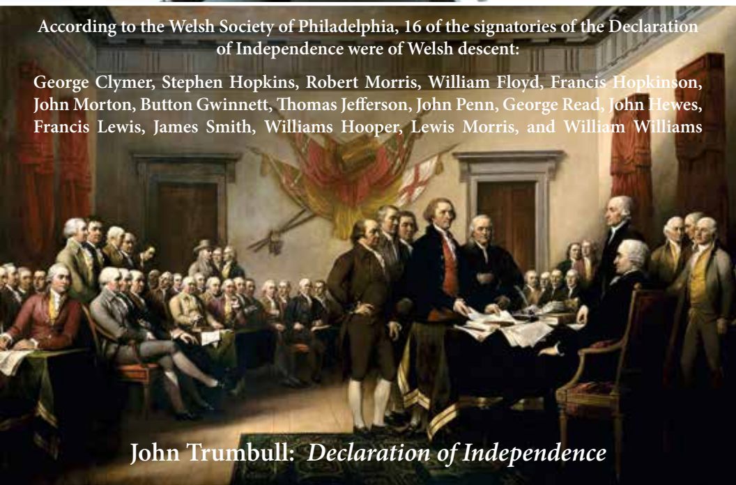
John Trumbull: Declaration of Independence

George Clymer, Stephen Hopkins, Robert Morris, William Floyd, Francis Hopkinson, John Morton, Button Gwinnett, Thomas Jefferson, John Penn, George Read, John Hewes, Francis Lewis, James Smith, Williams Hooper, Lewis Morris, and William Williams