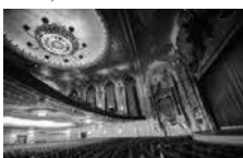
The historic Steuben County in Utica, New York, will be the venue for the 2021 Annual Festival

The North American Festival of Wales will be held in Utica, New York, on July 10-11, 2021. The festival will feature a variety of activities, including music, dance, and food. The festival will be held in Utica, New York, on July 10-11, 2021.