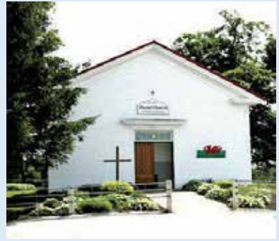
Peniel Chapel, Rewey

sends its wishes for a successful 2021 North American Festival of Wales