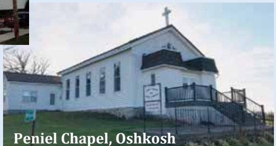
Peniel Chapel, Oshkosh