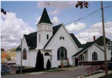
Cambria First Presbyterian Church, Cambria

featuring Welsh Weekend for All and the Christmas Gymanfa Ganu